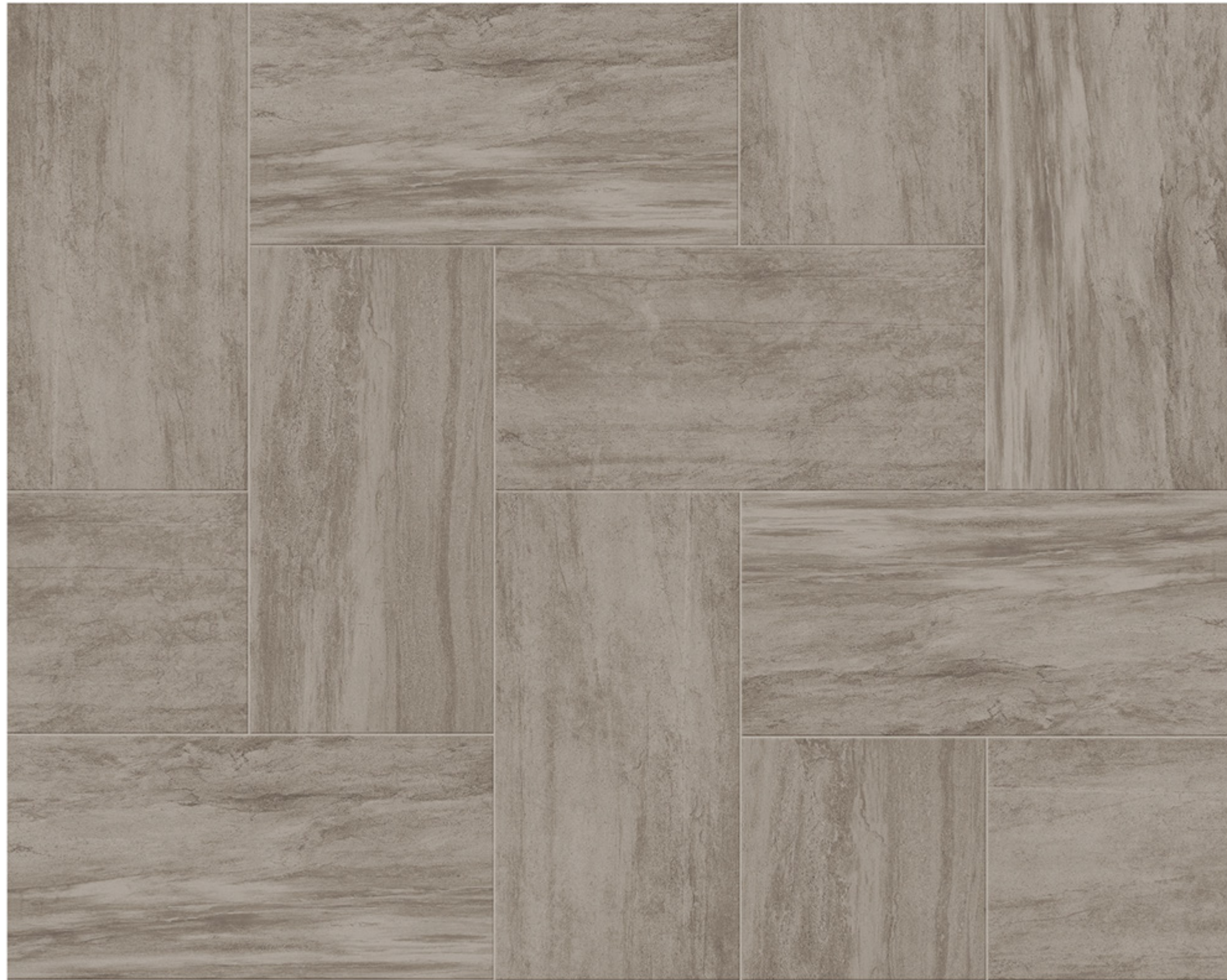
REMIX Jazz 60x120cm | GRM02