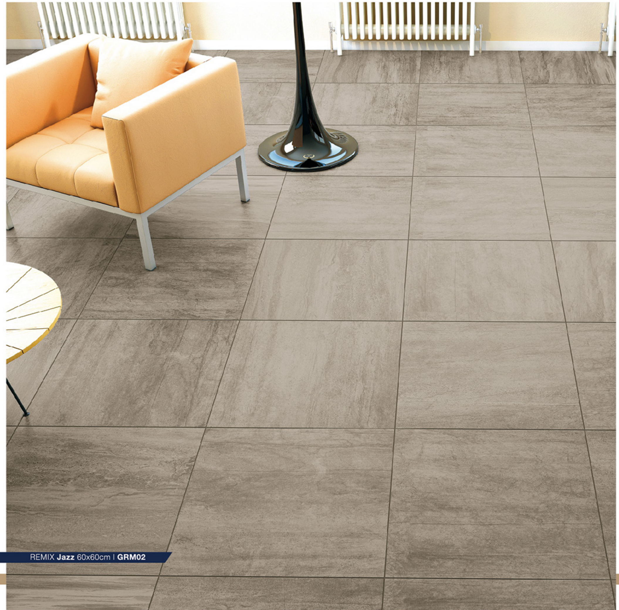
REMIX Jazz 60x60cm | GRM02