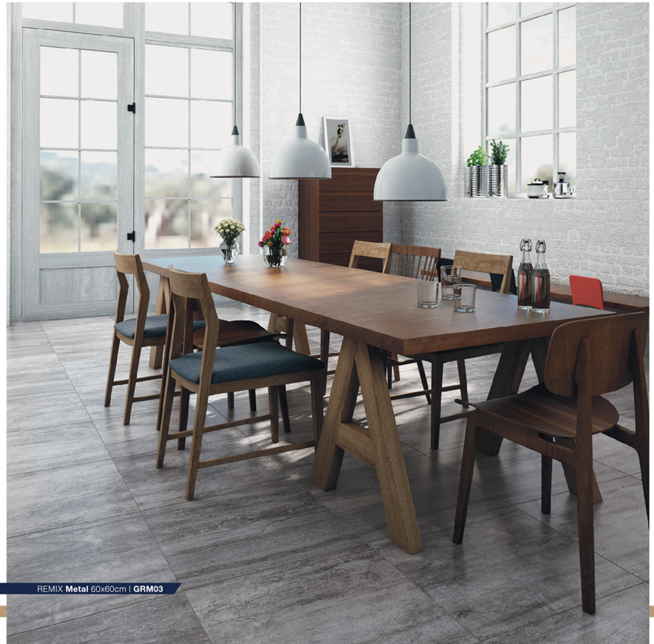
REMIX Metal 60x60cm | GRM03