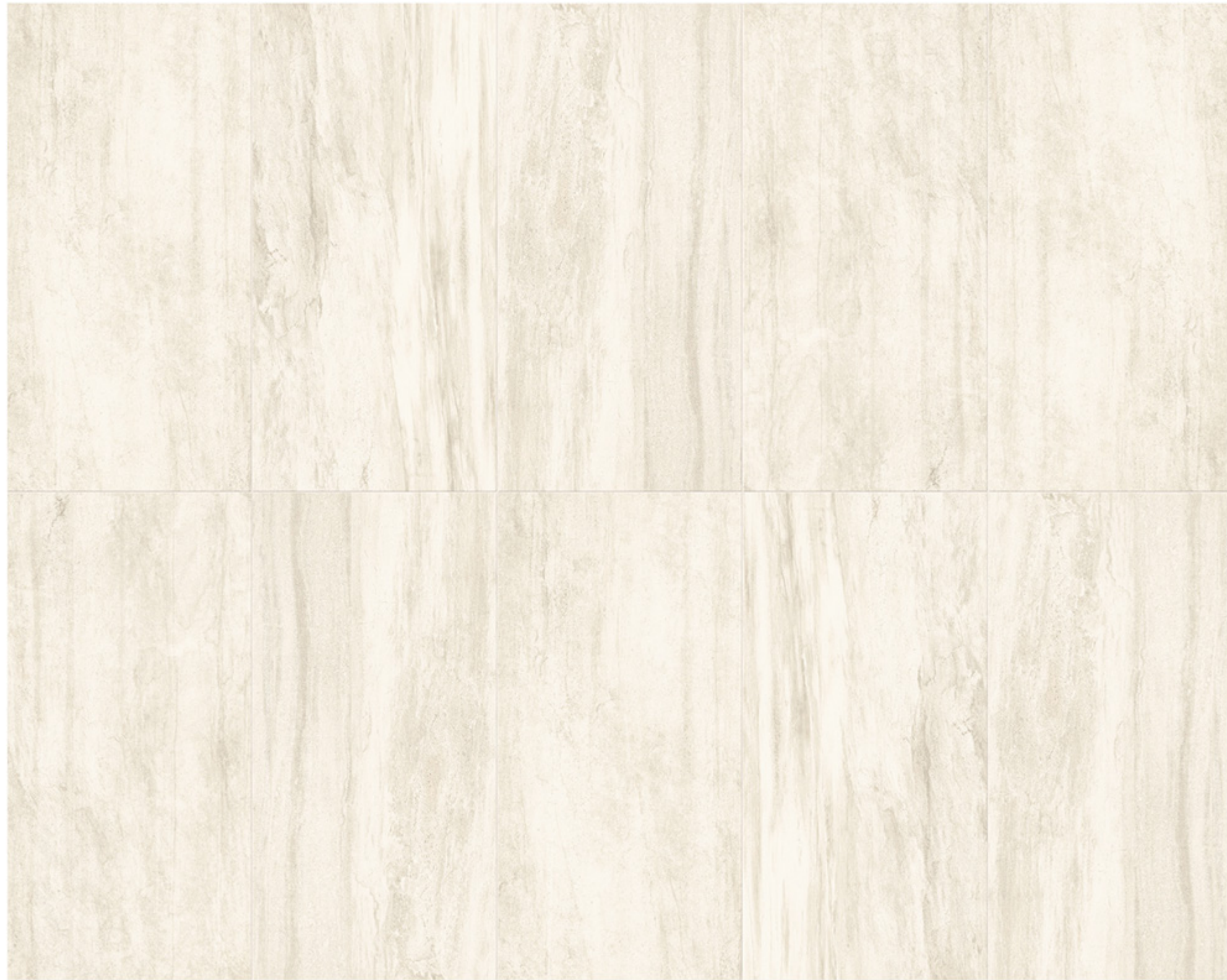
REMIX Folk 60x120cm | GRM01