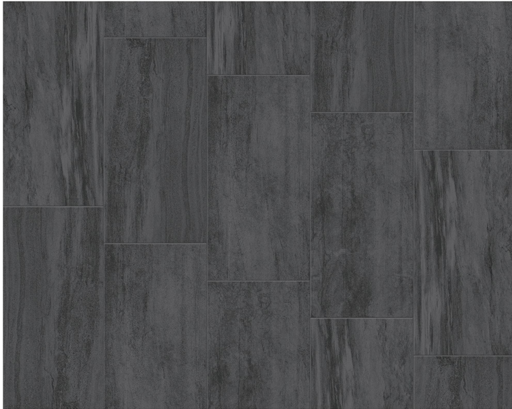
REMIX Pop Rock 60x120cm | GRM04