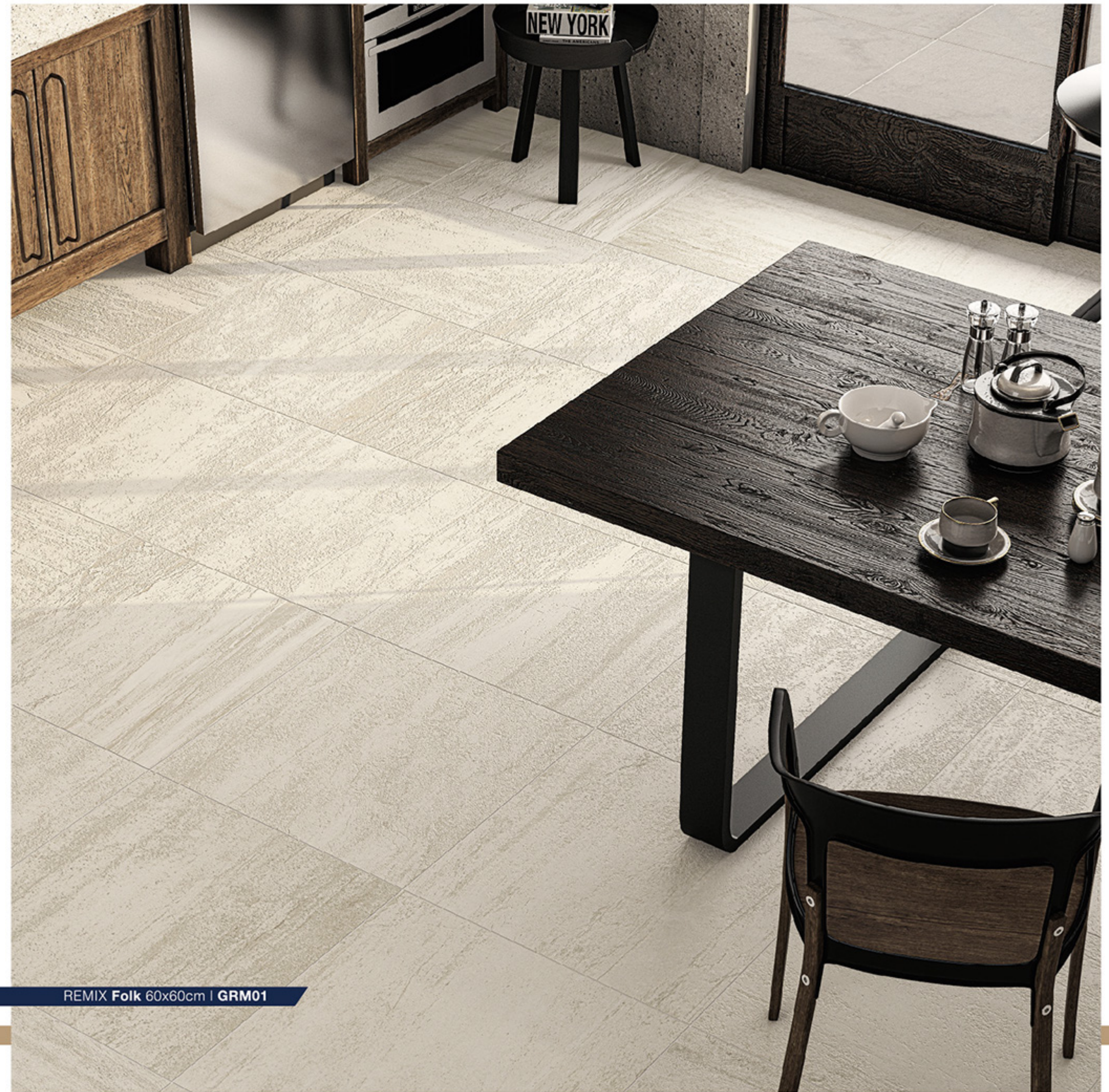
REMIX Folk 60x60cm | GRM01