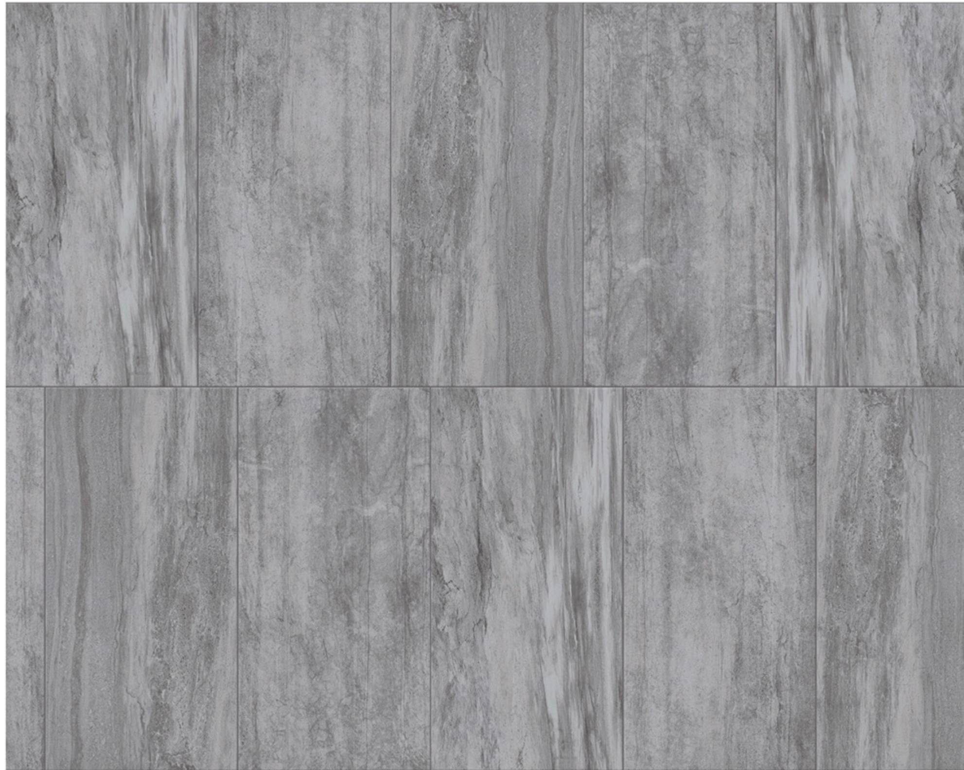
REMIX Metal 60x120cm | GRM03