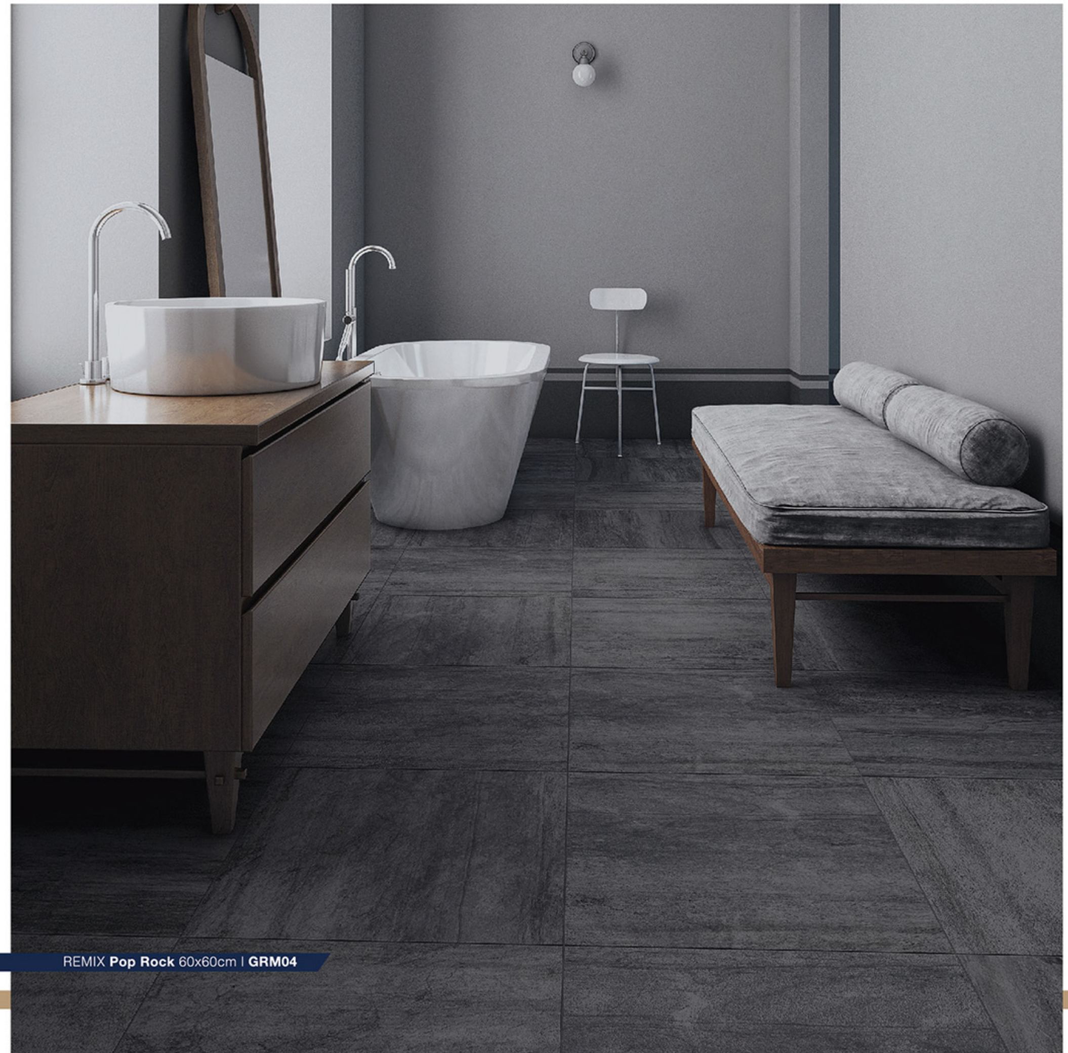
REMIX Pop Rock 60x60cm | GRM04