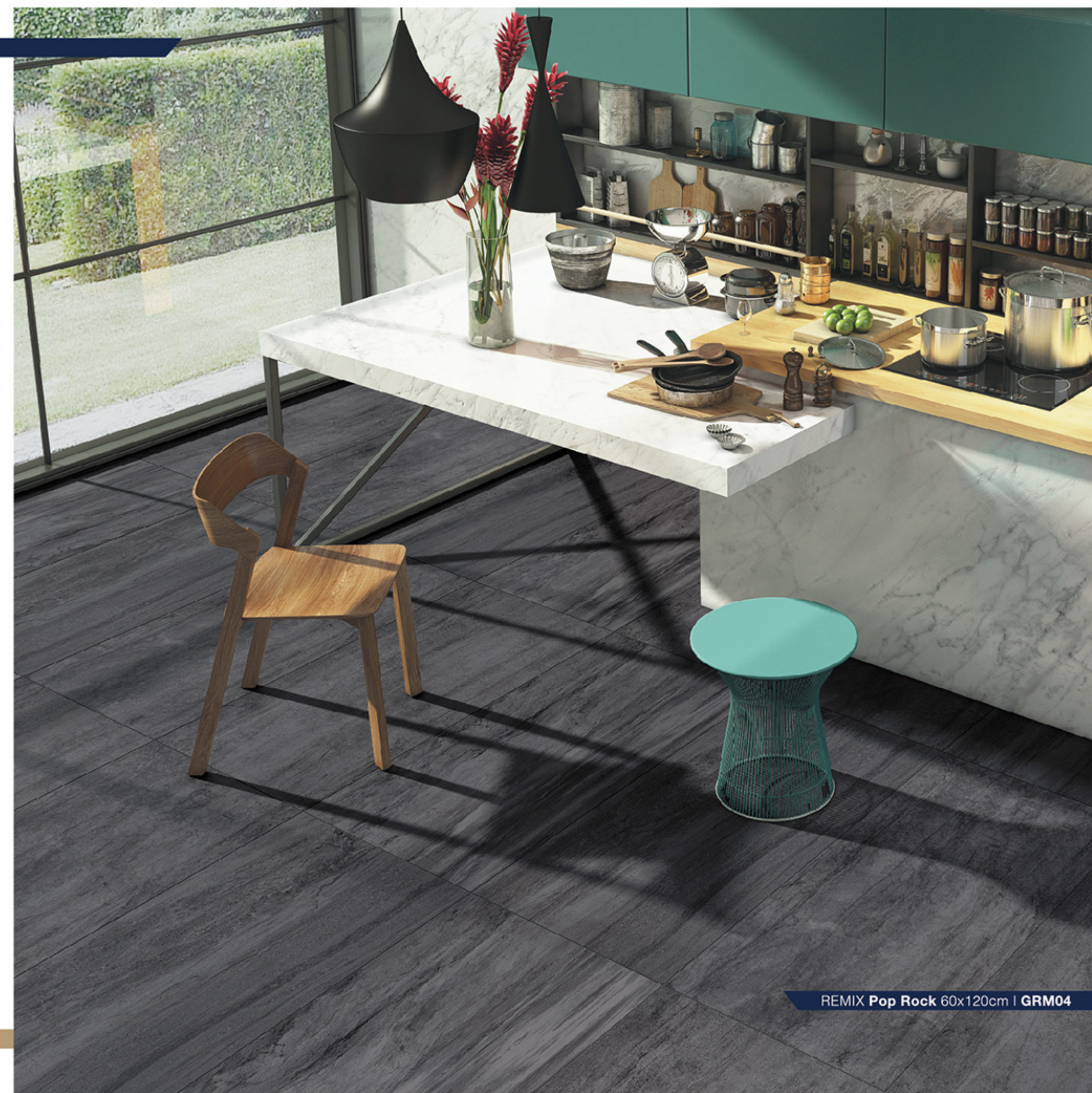
REMIX Pop Rock 60x120cm | GRM04