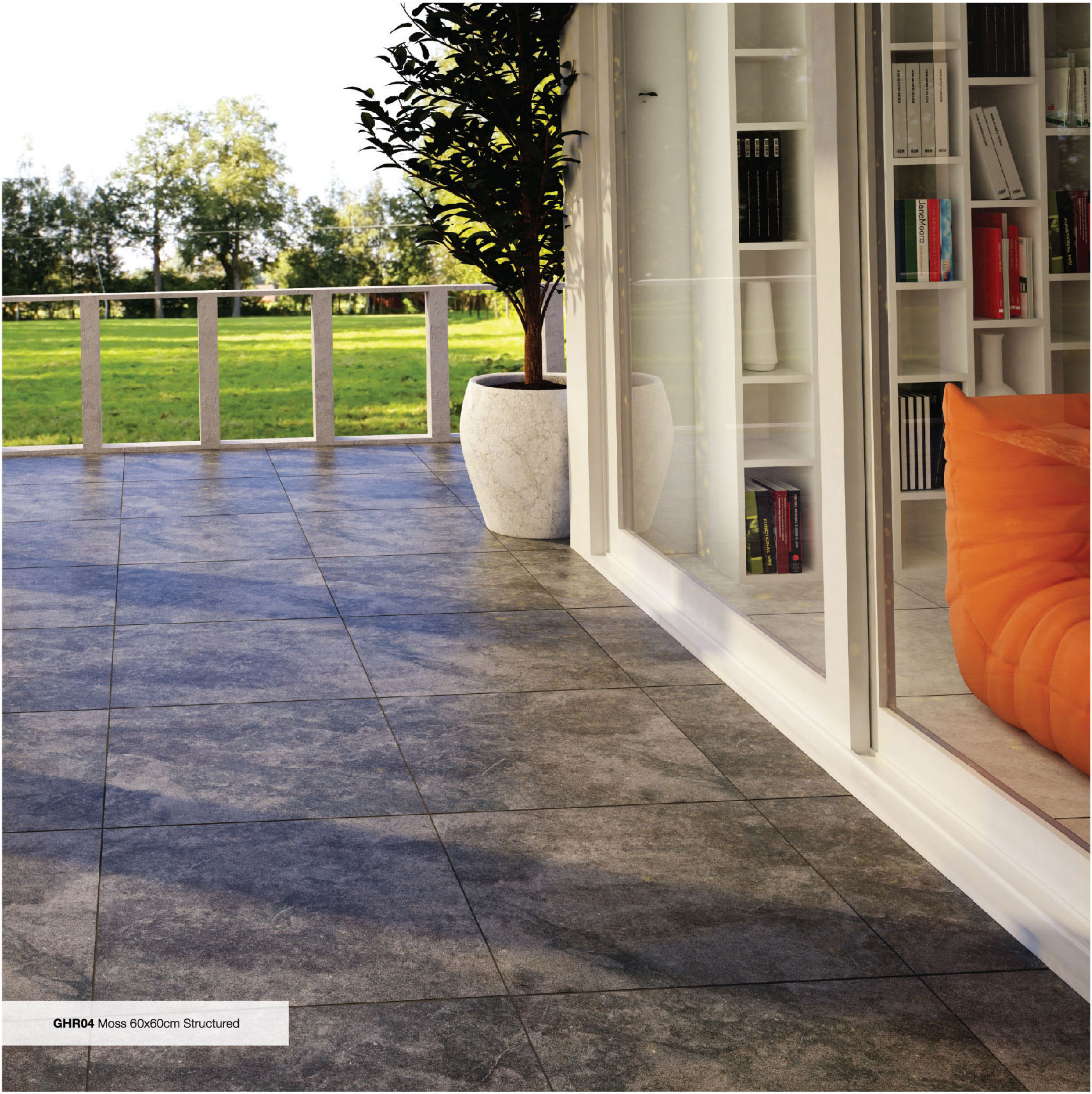
GHR04 Moss 60x60cm Structured